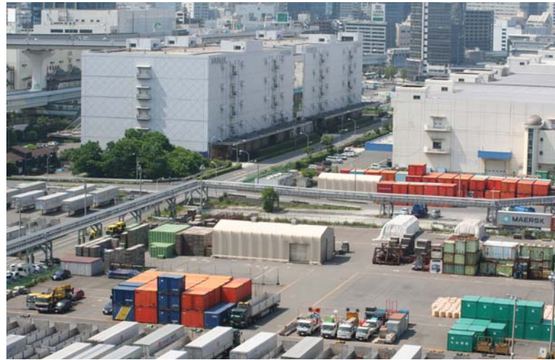
Waterfront Warehouses in Shibaura Pier

to operate with full functionality. Given that the demand for logistics facilities is expected to increase considerably as relief efforts make way for reconstruction over the short to mid term, occupancy levels at logistics facilities are expected to increase, particularly within the Greater Tokyo area. Demand for modern distribution