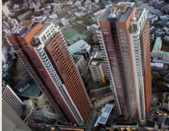
Roppongi Hills Residences

Osaka market. Western Japan may also witness heightened demand for back office space over the longer term as occupiers seek to manage seismic risk and implement business contiguity strategies. The largest short-term risks for the Tokyo real estate market remain the ongoing situation in Fukushima and the associated power supply problems. If conditions in Fukushima were to deteriorate significantly or power supply uncertainties to continue for an indefinite period, instances of relocation to the economic centres of western Japan are likely to increase.