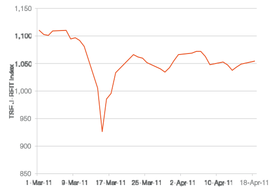
CHART 2 TSE J-REIT index, 1 Mar - 18 Apr 2011

According to FocusEconomics, preliminary post-quake forecasts from 24 private-sector research institutions suggest that Japan's economic output will contract by a seasonally adjusted annualised rate of -1.0% in the second quarter. This compares with a consensus growth forecast of 1.6% in