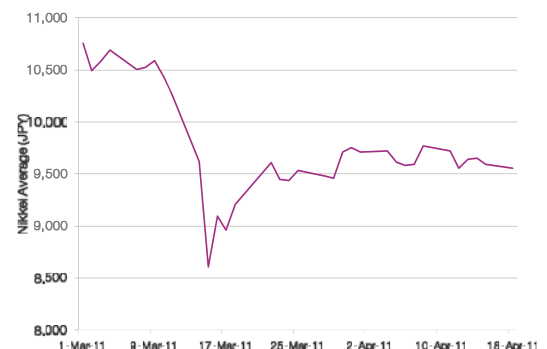
CHART 3 Nikkei 225 stock price index, 1 Mar - 18 Apr 2011